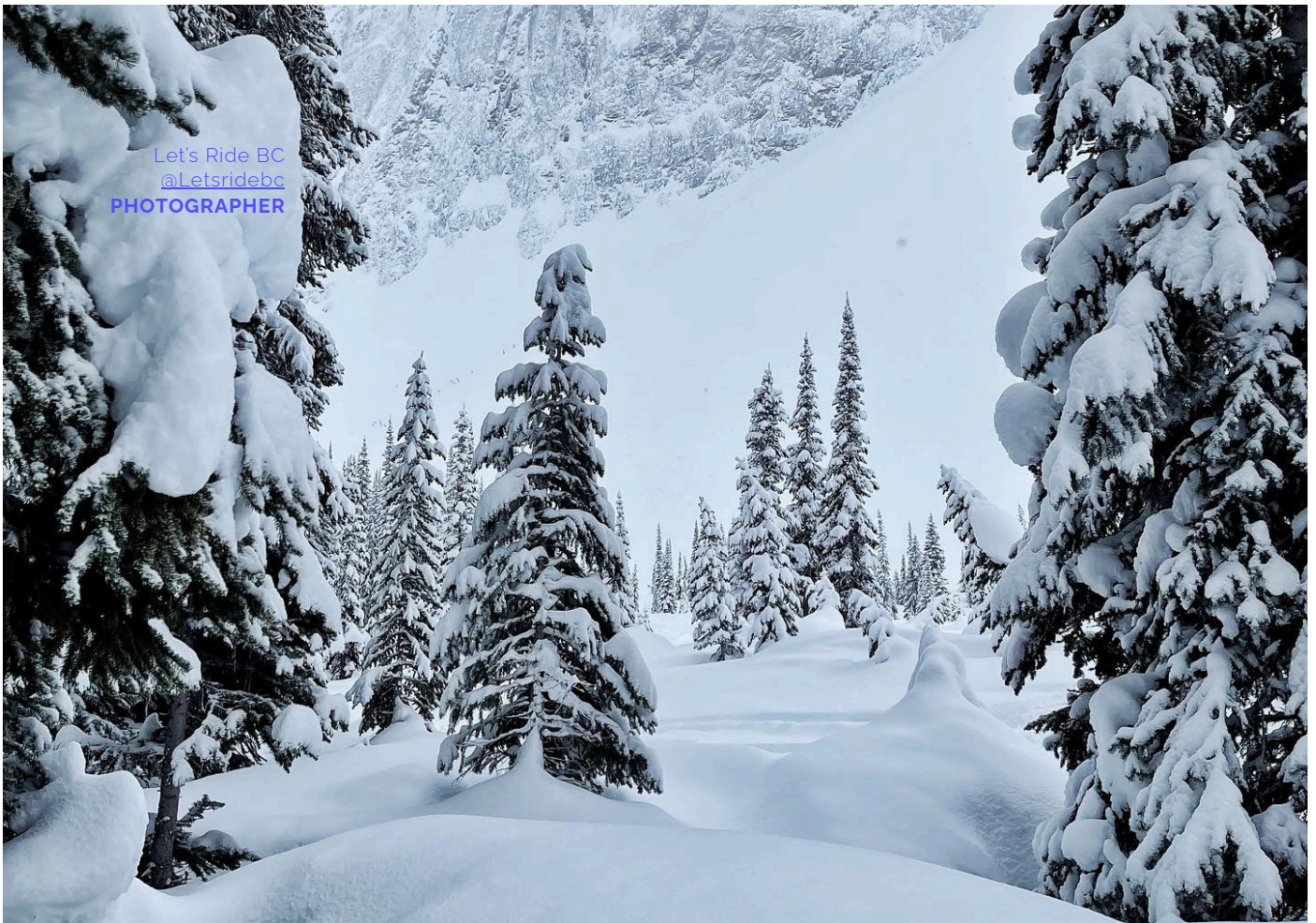
Let's Ride BC @Letsridebc PHOTOGRAPHER